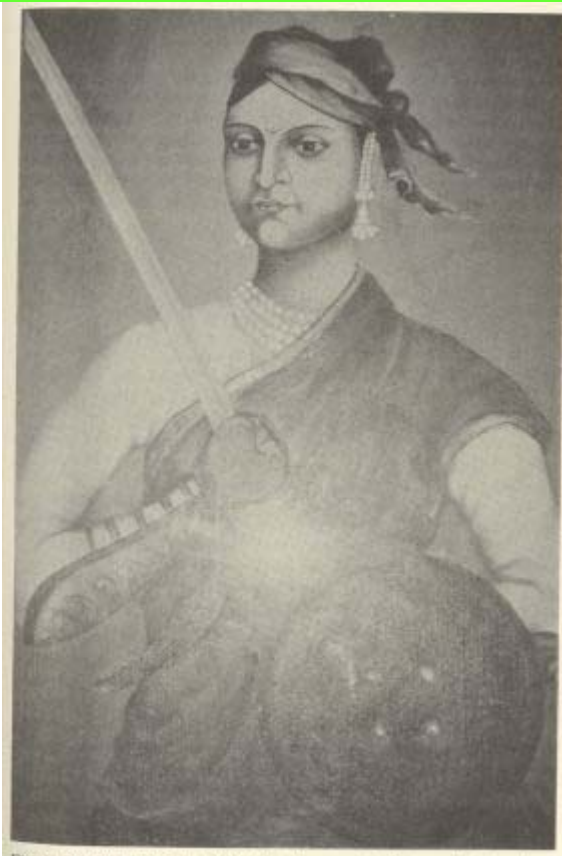
Fig. 2. Portrait of the Rani said to have been painted by an artist who knew her. The original is in the possession of the Tambe family, Nagpur.