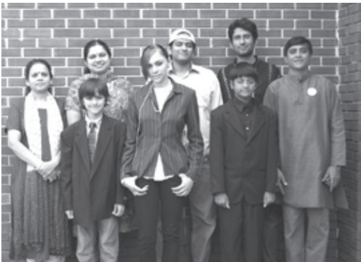
Name: Small Acts of Kindness Type: Adult Play Description: Play about how even small acts of kindness result in great dividend