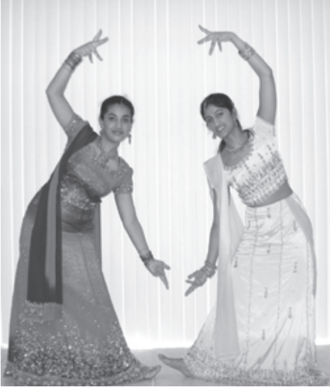
Name: Beedi- Jalaayile Type: Bollywood dance Description: Contemporary Indian movie dance