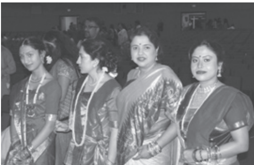
Name: Momo Chitte Type: Classical Dance Description: Elegant dance about good and evil in life.