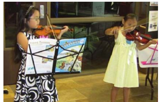
Talented young musicians playing violin