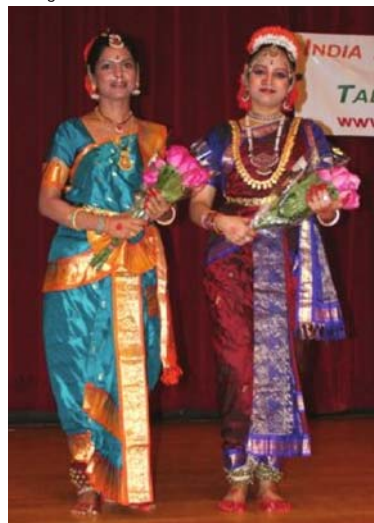
Indian Classical dancers