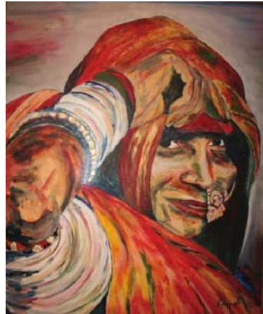
Coquetry by Roopali Kambo

The events organized by Asian Coalition of Tallahassee highlighted not only the diversity of people it also demonstrated that several Asian and Asian Pacific American Associations can come together for a common good.