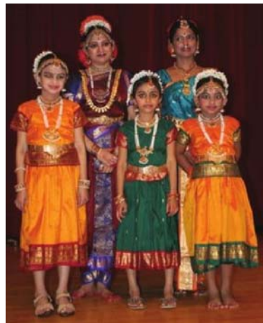
Young Indian dancers from Tallahassee