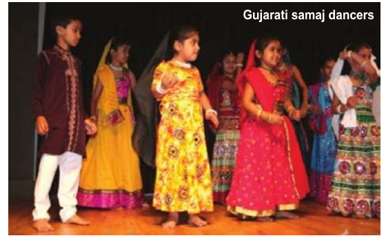
Gujarati samaj dancers