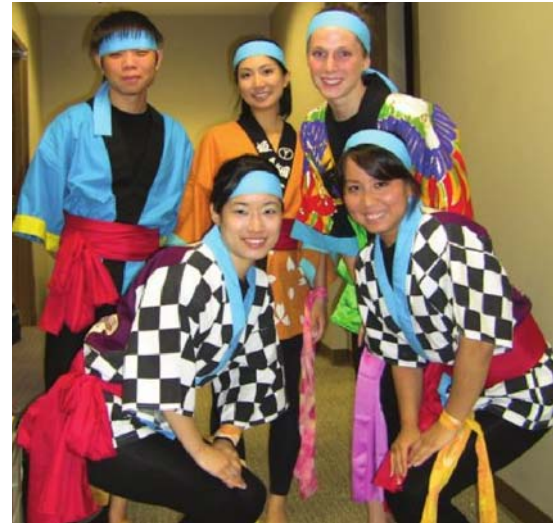
Dancers from Japanese Community of Tallahassee